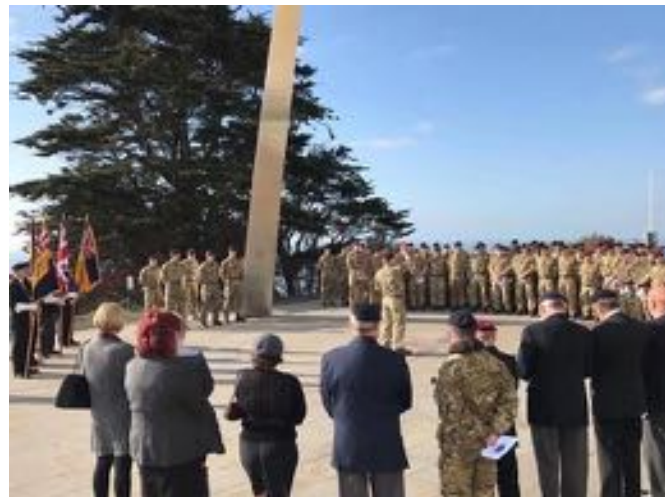
Dymchurch Royal British Legion and Step Short monthly parade on Sunday 2 April 2017 at the Memorial Arch, Folkestone. Approximately 100 members of 103 Battalion REME were in attendance plus three RBL standards, on a beautiful spring day.