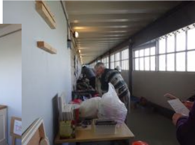
Preparations for the new season at Step Short's Mole Cafe on Folkestone Harbour Arm.